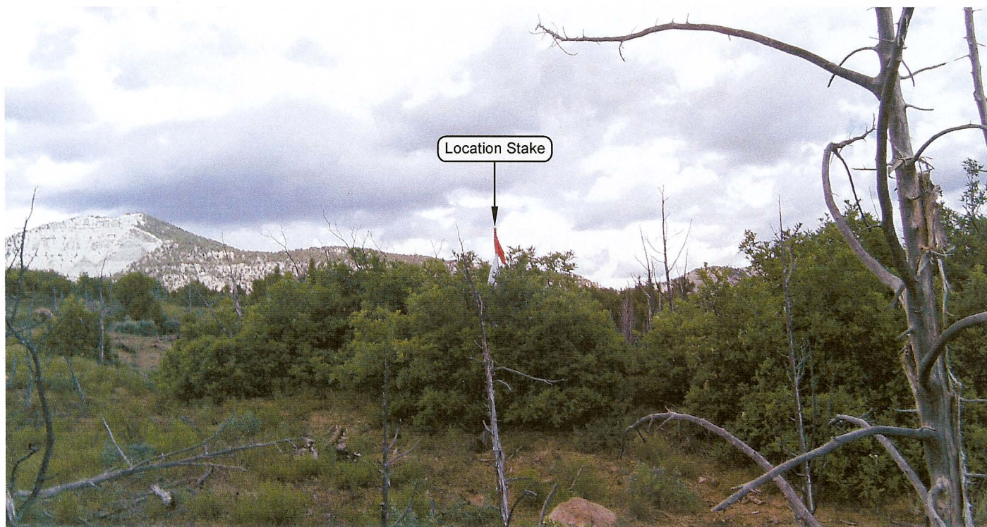
PHOTO LOCATION: LATITUDE LONGITUDE NAD 83: (39° 17' 06.43"N) (108° 29' 50.16"W)