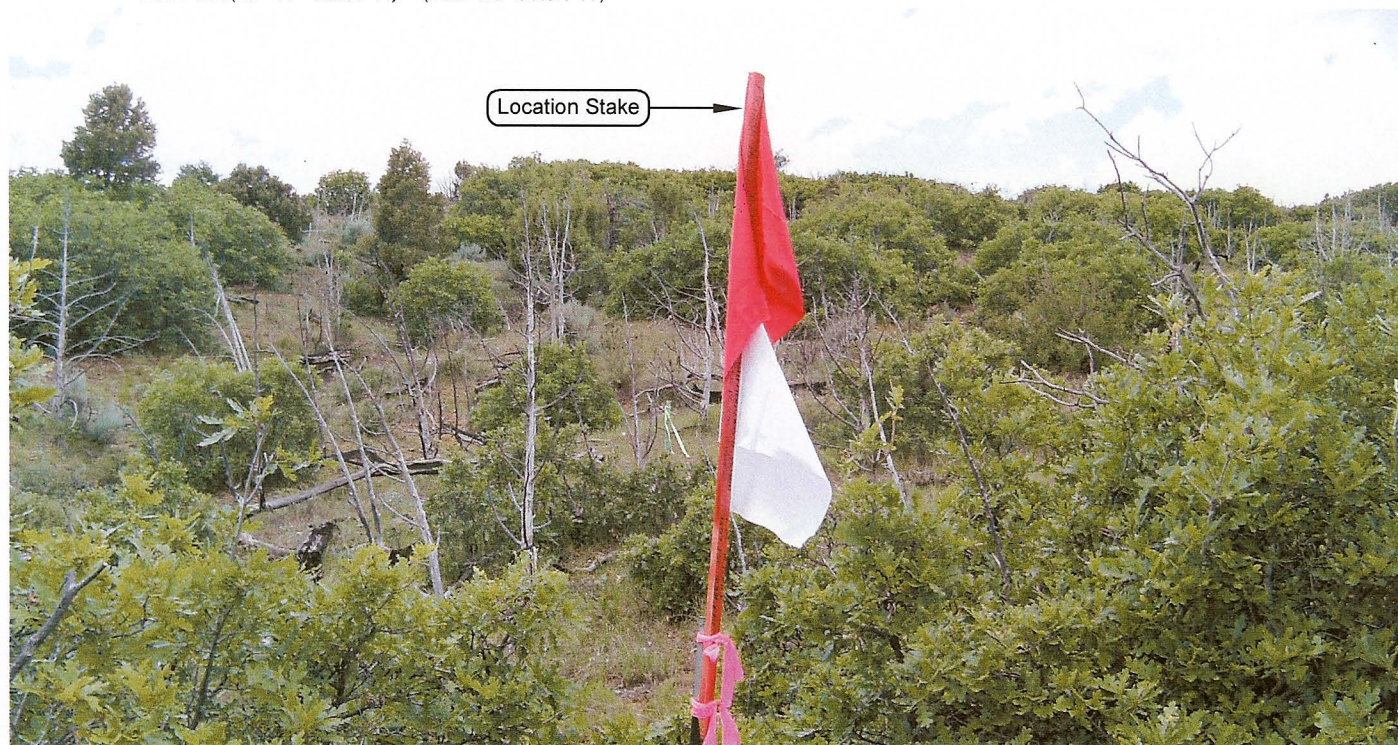
PHOTO LOCATION: LATITUDE LONGITUDE NAD 83: (39° 17' 06.89"N) (108° 29' 50.04"W)