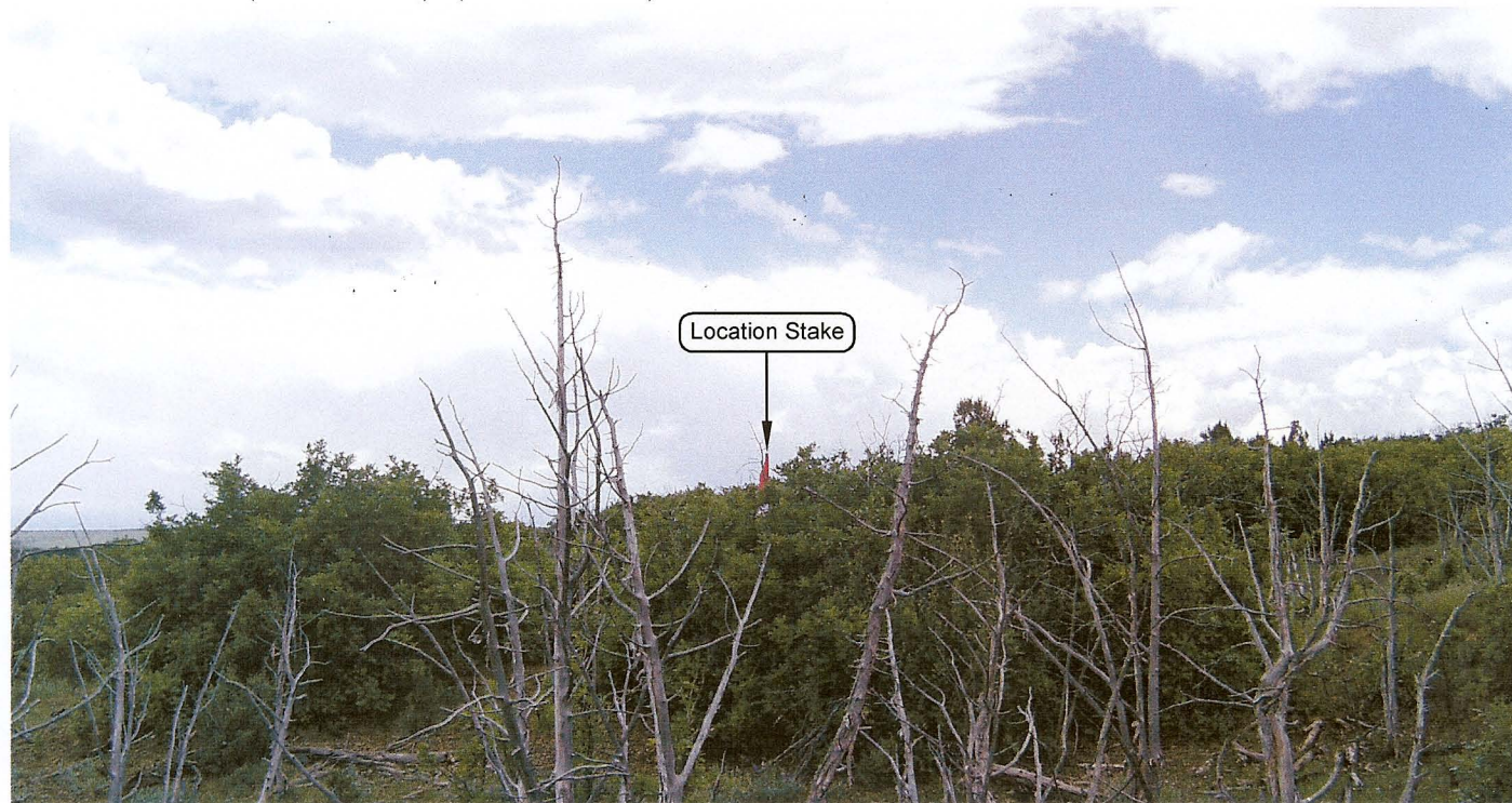
PHOTO LOCATION: LATITUDE LONGITUDE NAD 83: (39° 17' 07.48"N) (108° 29' 50.09"W)