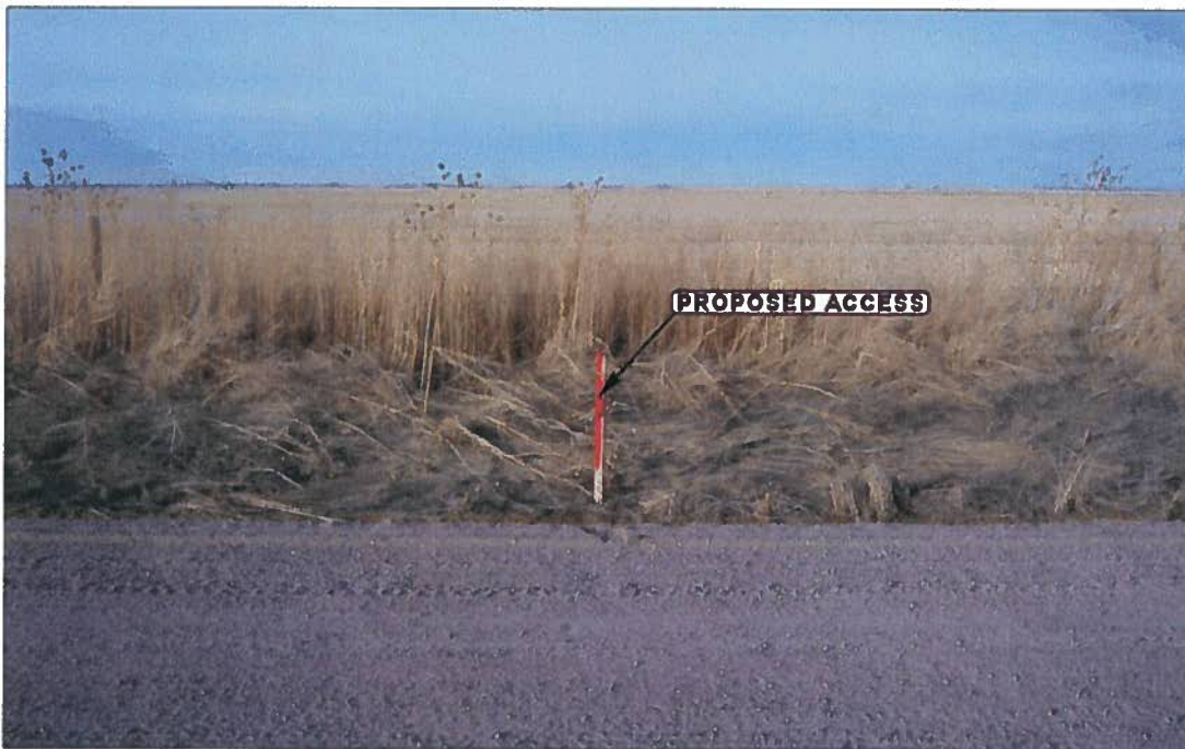
PHOTO: VIEW FROM BEGINNING OF PROPOSED ACCESS