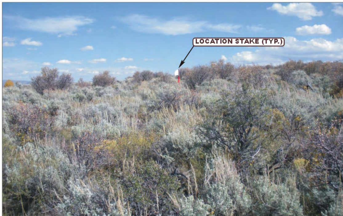
LOCATION STAKE (TYP.)