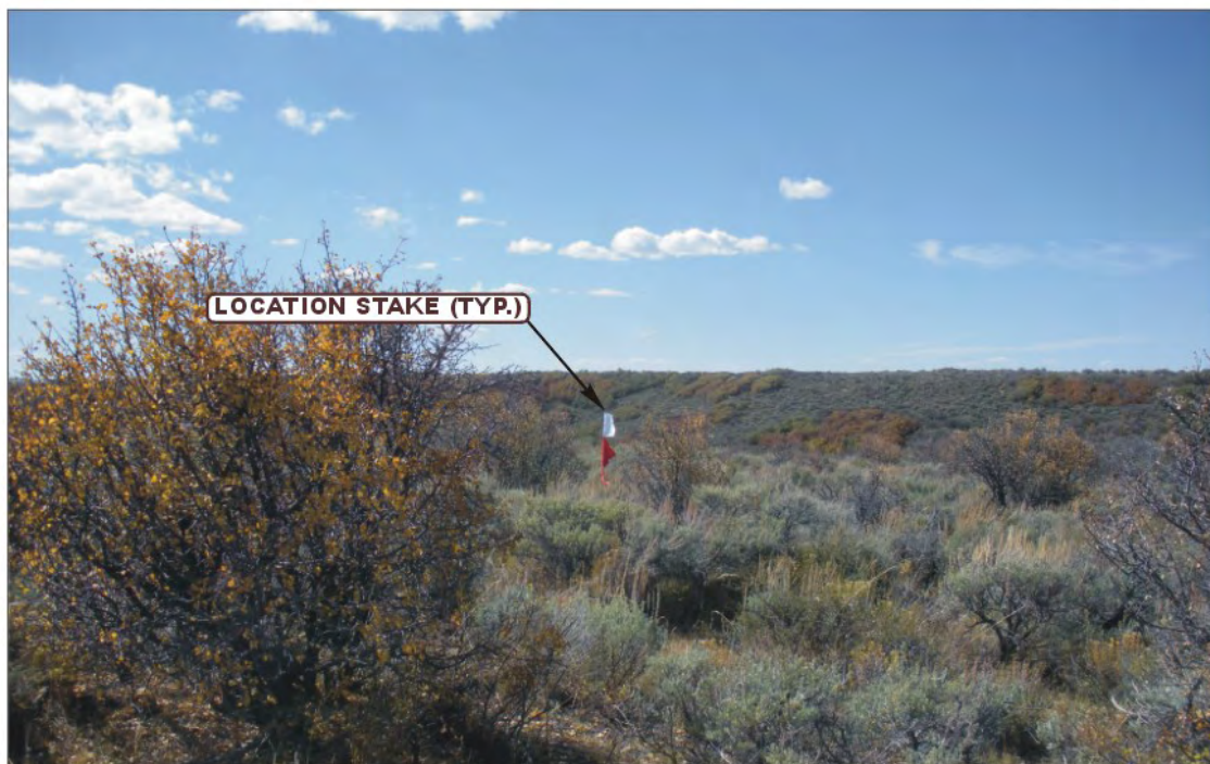
LOCATION STAKE (TYP.)