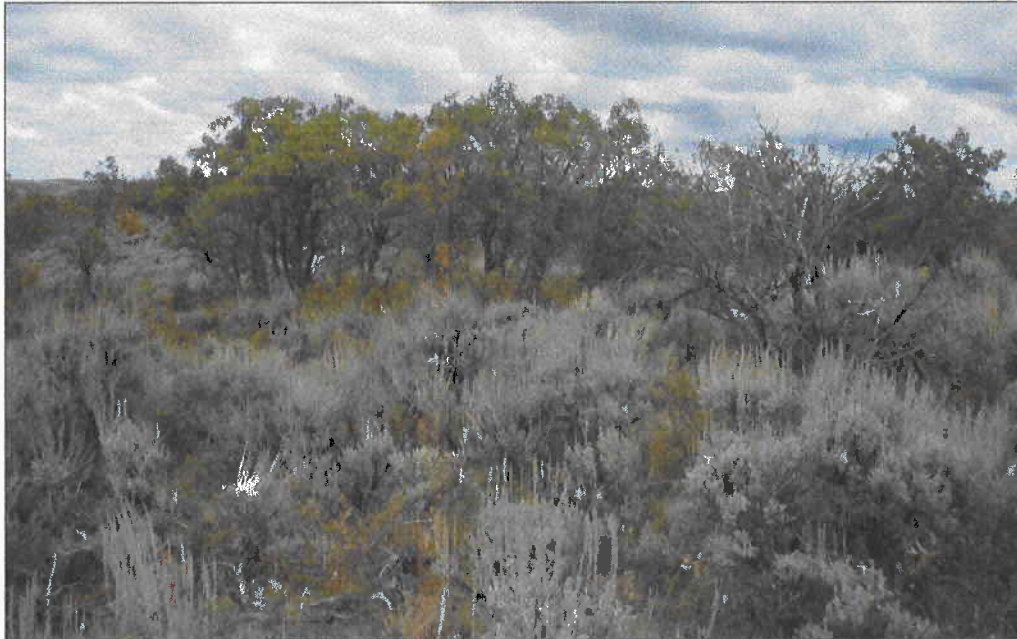
PHOTO: REFERENCE AREA VIEW

LOCATED IN GARFIELD COUNTY, COLORADO SECTION 33, T5S, R95W, 6th P.M. NE 1/4 SE 1/4