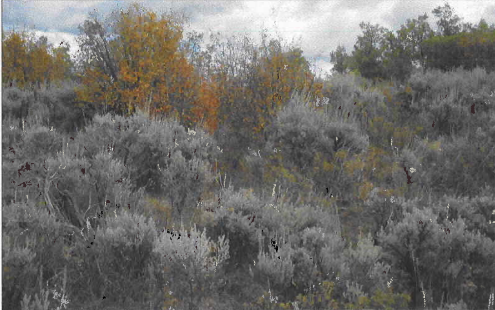
PHOTO: REFERENCE AREA VIEW

LOCATED IN GARFIELD COUNTY, COLORADO SECTION 33, T5S, R95W, 6th P.M. NE 1/4 SE 1/4