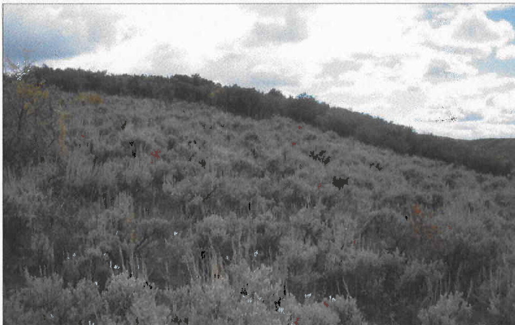
PHOTO: REFERENCE AREA VIEW