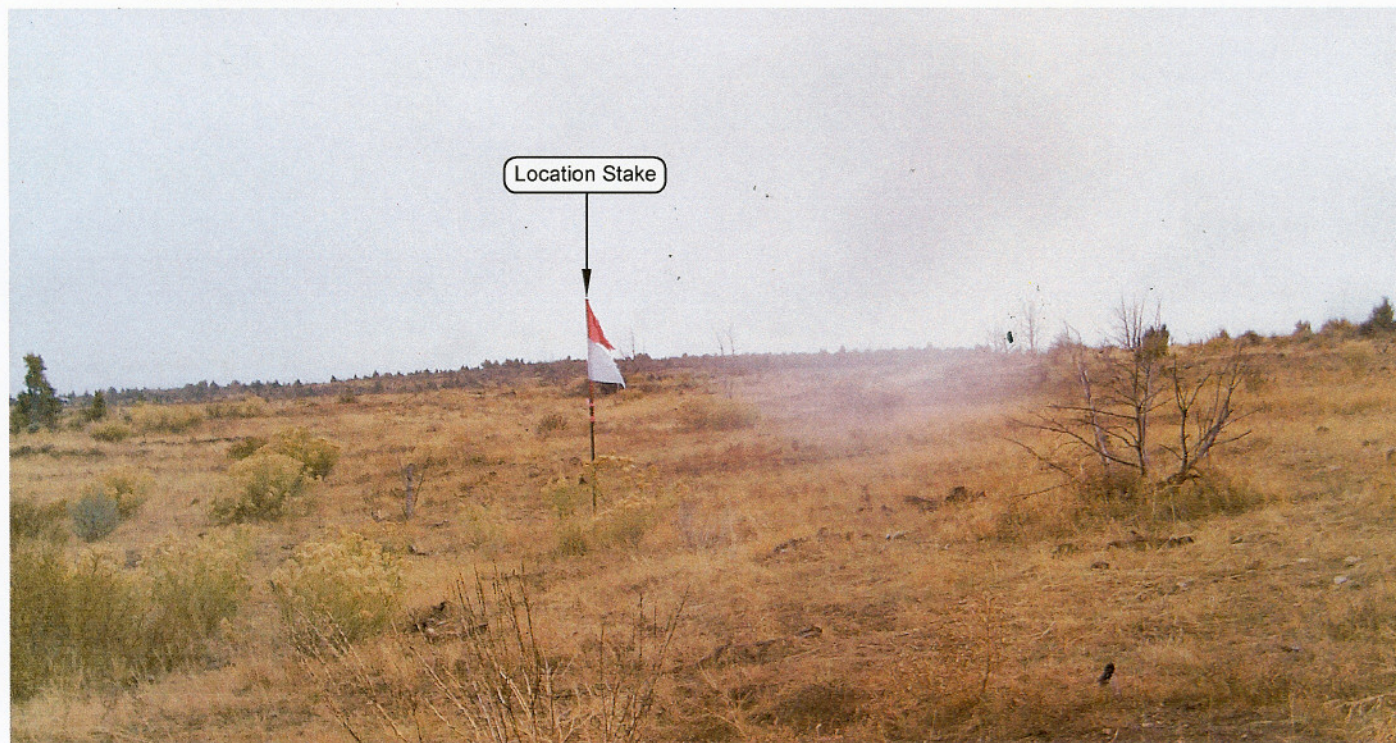
PHOTO LOCATION: LATITUDE LONGITUDE NAD 83: (40° 00' 57.37"N) (108° 24' 37.37"W)