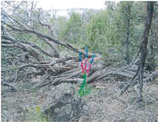
REFERENCE CENTER LOOKING NORTH DATE 7/24/2009