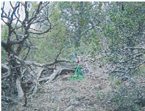
REFERENCE CENTER LOOKING EAST DATE 7/24/2009