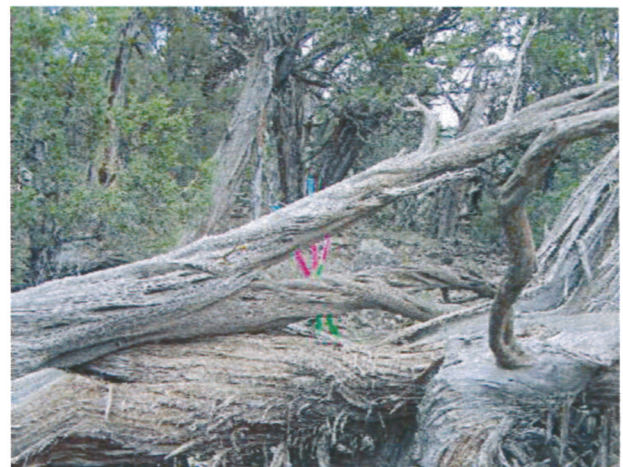
REFERENCE CENTER LOOKING SOUTH DATE 7/24/2009