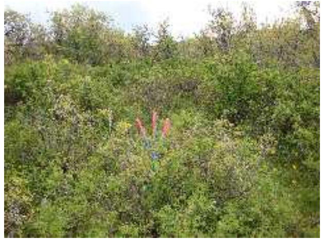
LOOKING SOUTH TOWARD CENTER OF REFERENCE AREA JUNE 4, 2009