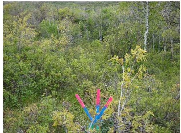
LOOKING WEST TOWARD CENTER OF REFERENCE AREA JUNE 4, 2009