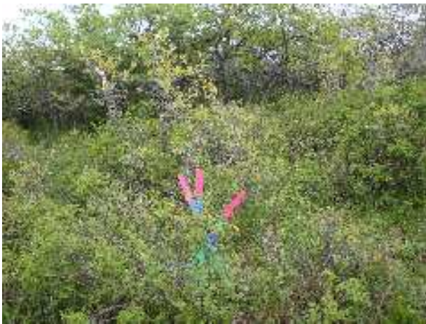
LOOKING EAST TOWARD CENTER OF REFERENCE AREA JUNE 4, 2009