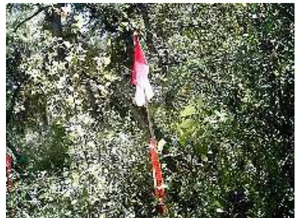
LOOKING WEST TOWARD LOCATION SEPTEMBER 16, 2008