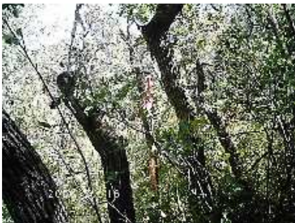
LOOKING EAST TOWARD LOCATION SEPTEMBER 16, 2008