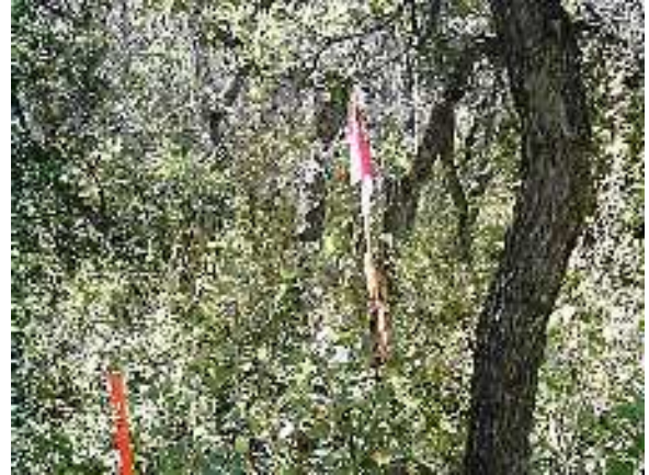
LOOKING SOUTH TOWARD LOCATION SEPTEMBER 16, 2008