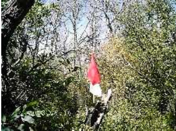
LOOKING NORTH TOWARD LOCATION SEPTEMBER 16, 2008