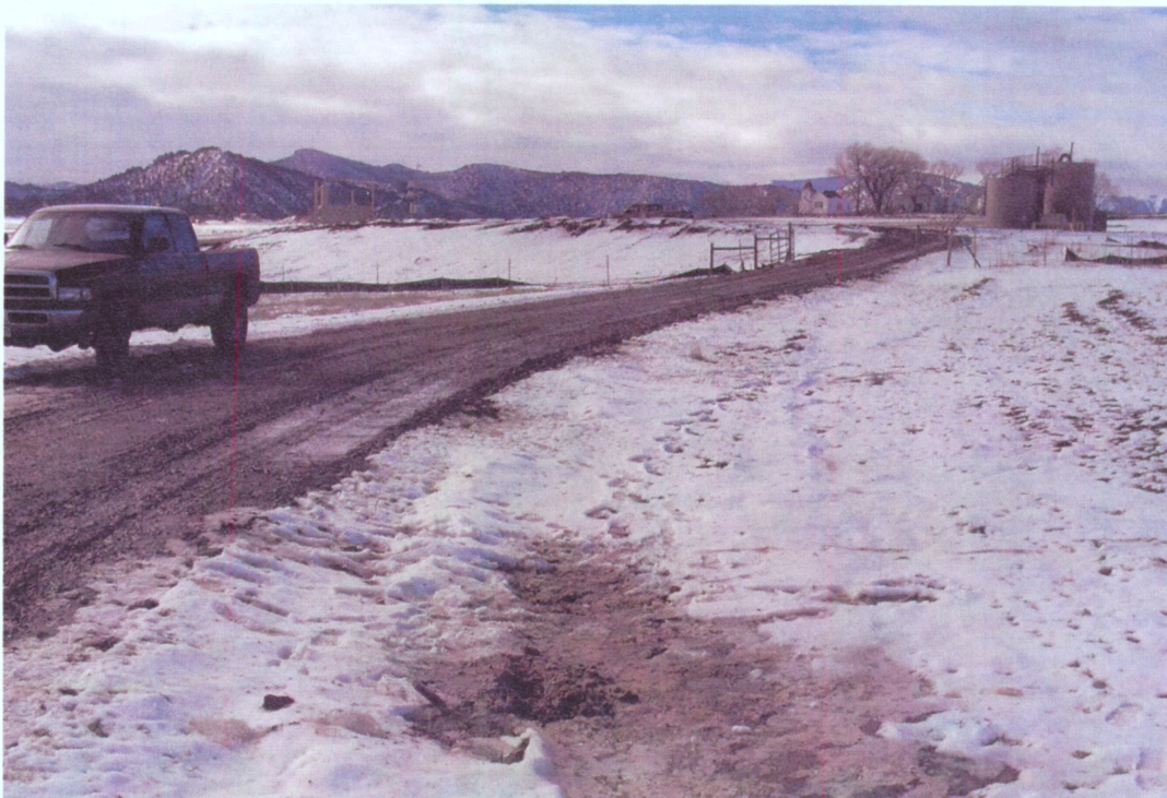
Photograph 10 – SCULV soil sample location looking to the southwest.