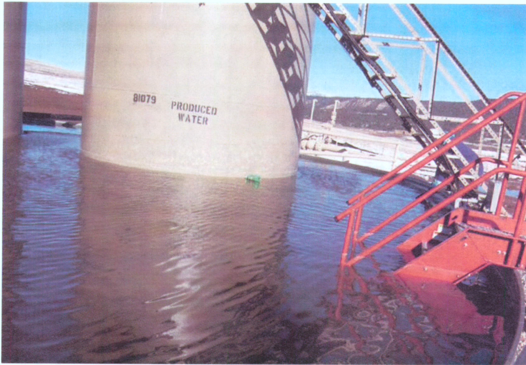
Photograph 3 – Containment ring full of CBM water looking to the north.