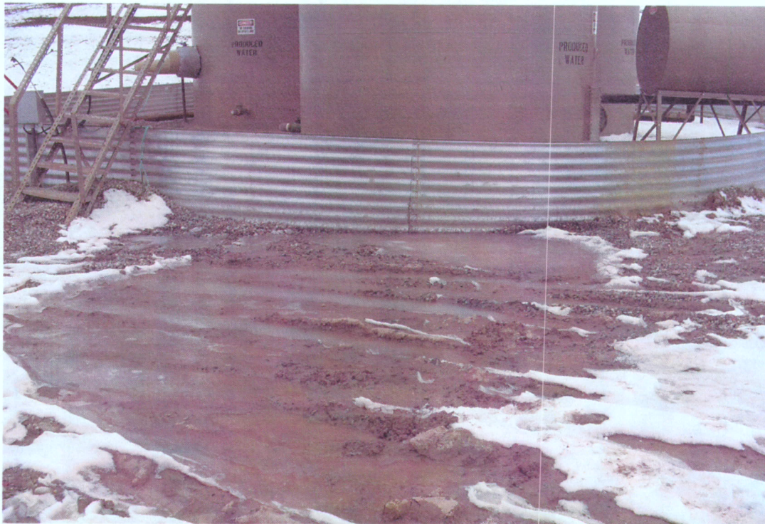
Photograph 8– SPAD soil sample location.