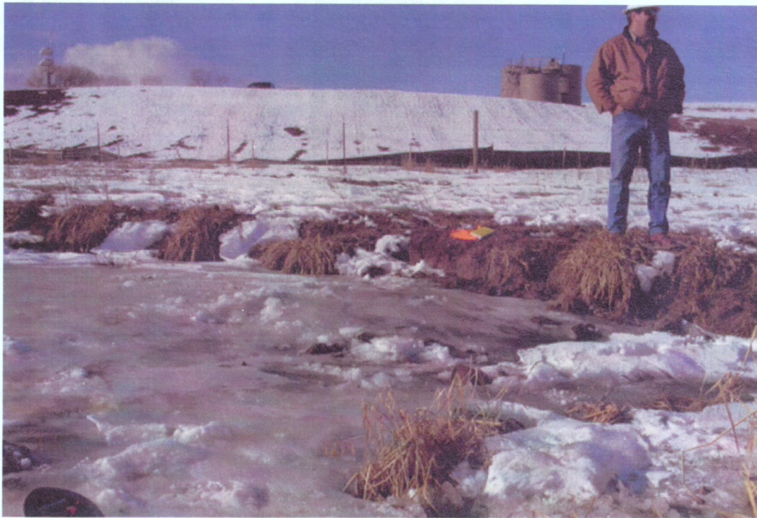
Photograph 6 – DBKG Sample location looking to the west. The B26E well pad is in the background.