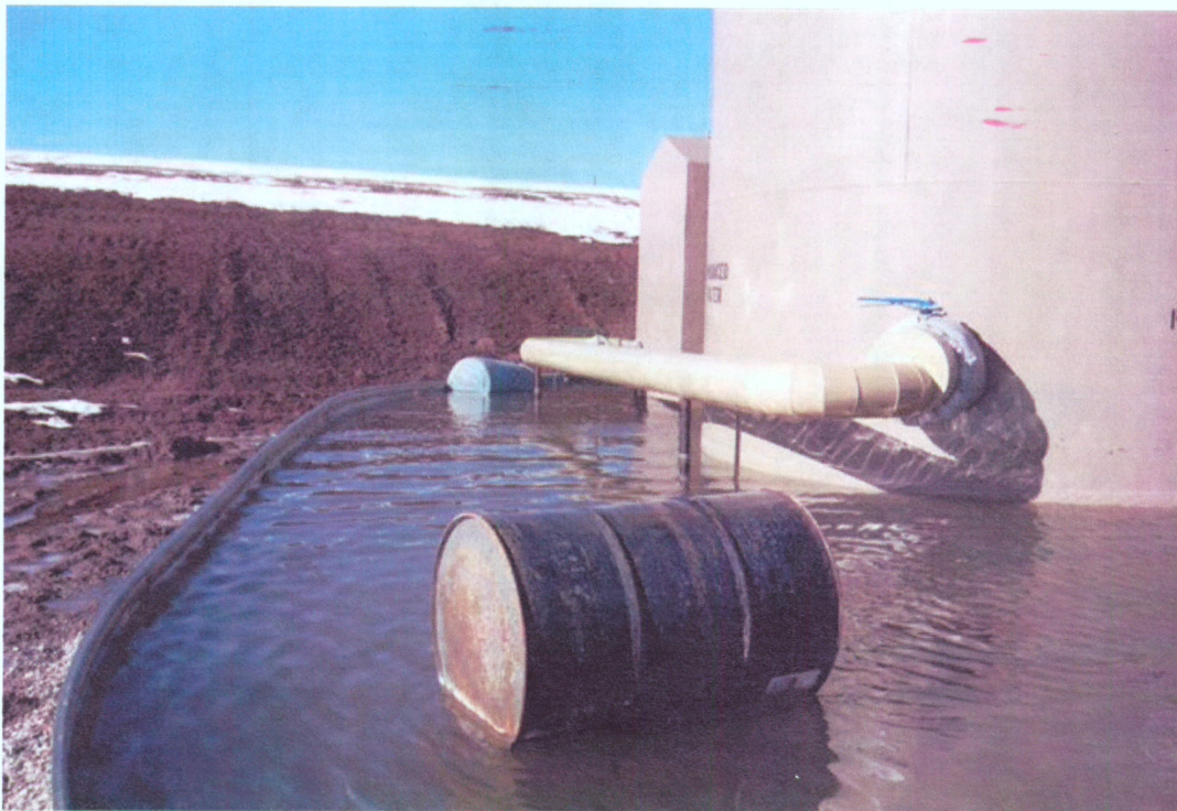
Photograph 2 – Containment Ring full of CBM water looking west.