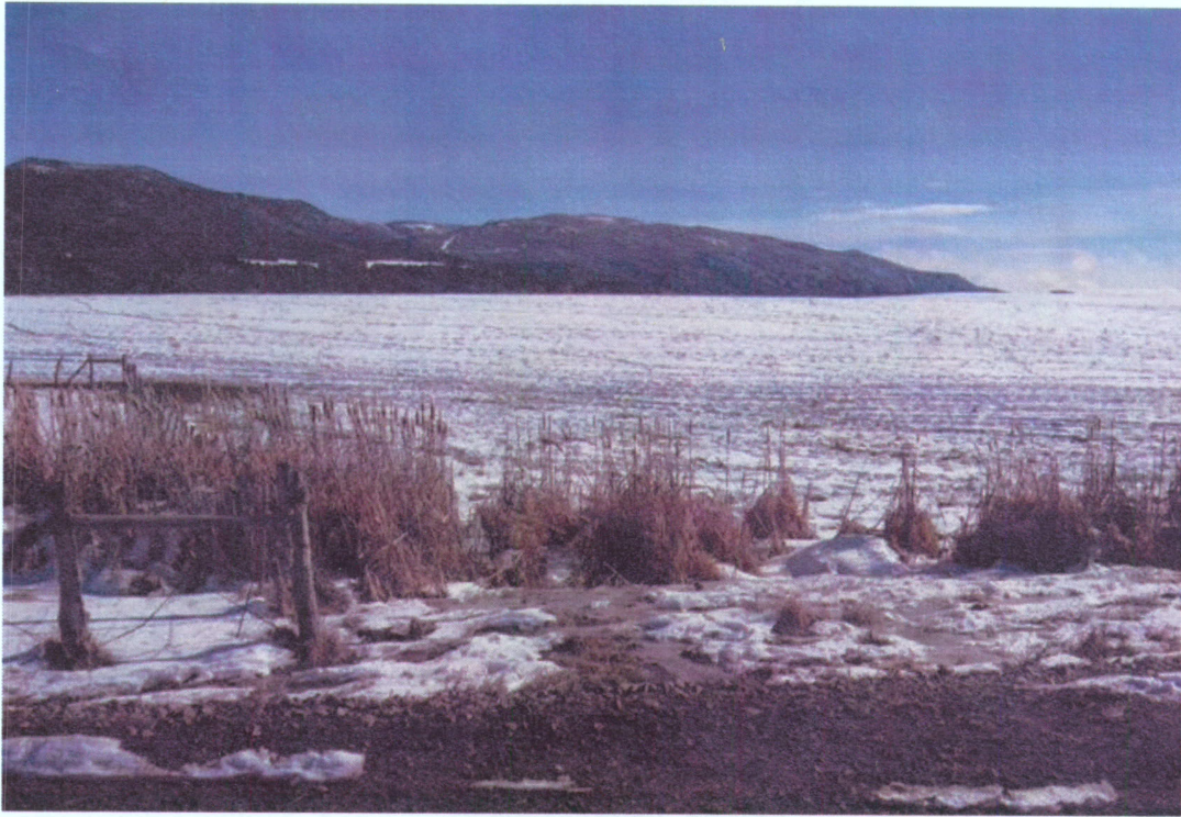
Photograph 5 – Point where culvert releases to unnamed drainage. Photo taken looking to the southeast.