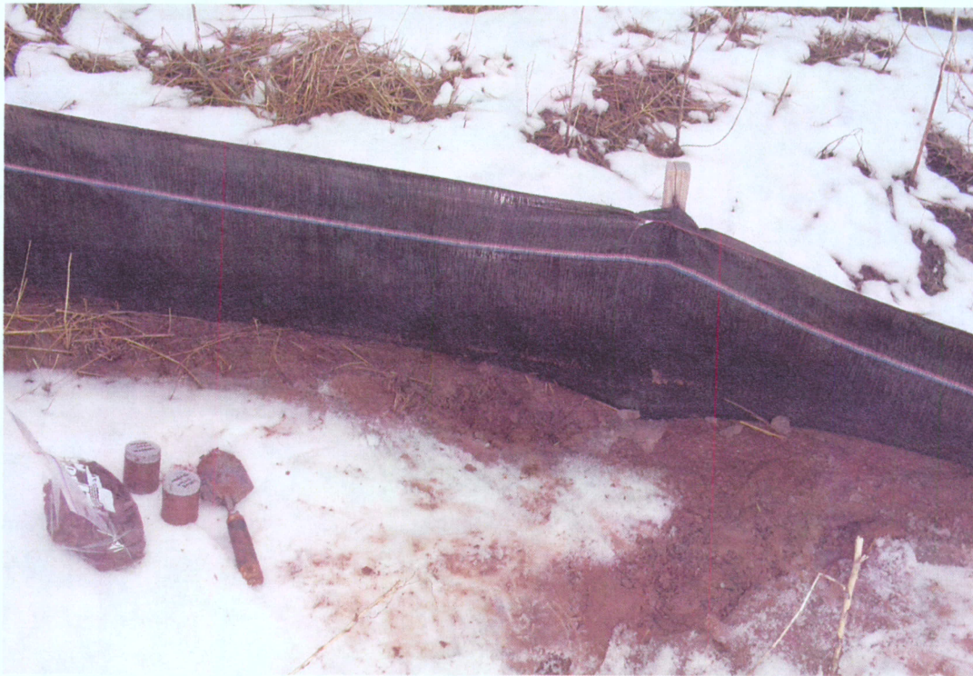
Photograph 9 – SSFENCE soil sample location.