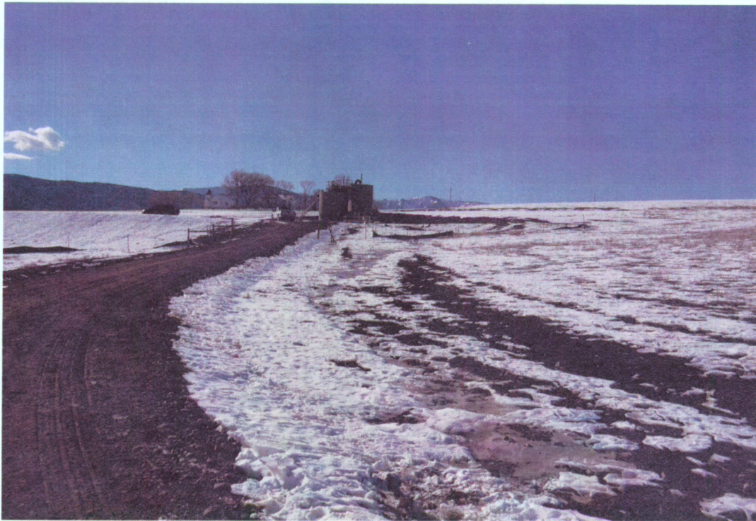
Photograph 4 – Photo looking southwest at the B26E well pad. Photo taken from culvert looking back at the silt fences and production water tanks.