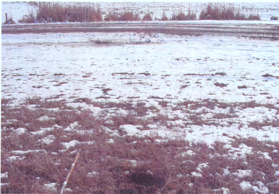
Photograph 11 – SBKG soil sample location looking to the east.