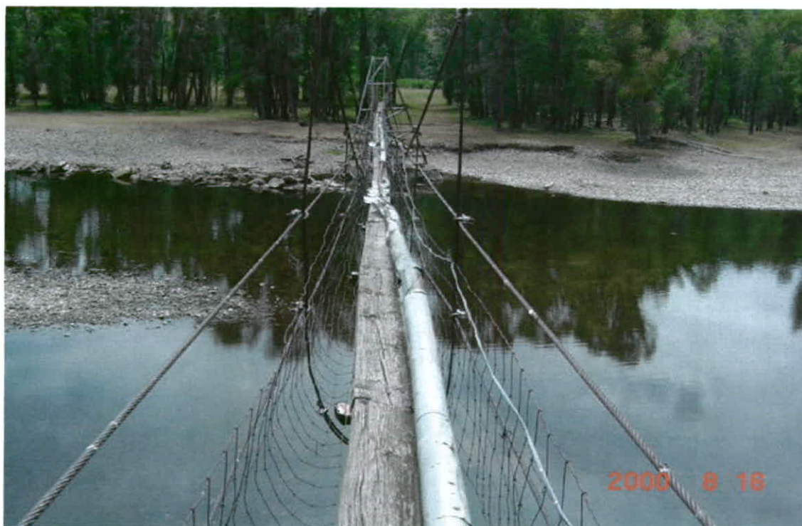
Photo 3 – View looking south across the Tow Creek Bridge in August 2000.