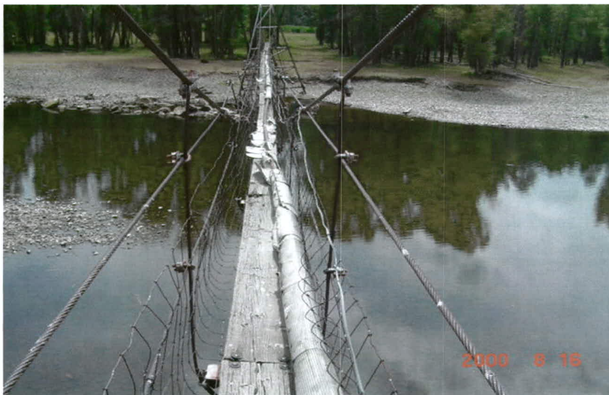
Photo 5 – View looking south in August 2000 (low water) at pipeline with damaged insulation.