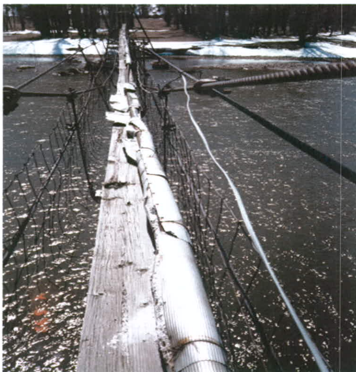
Photo 6 – View looking south in April 1999 (high water) at pipeline and damaged insulation.