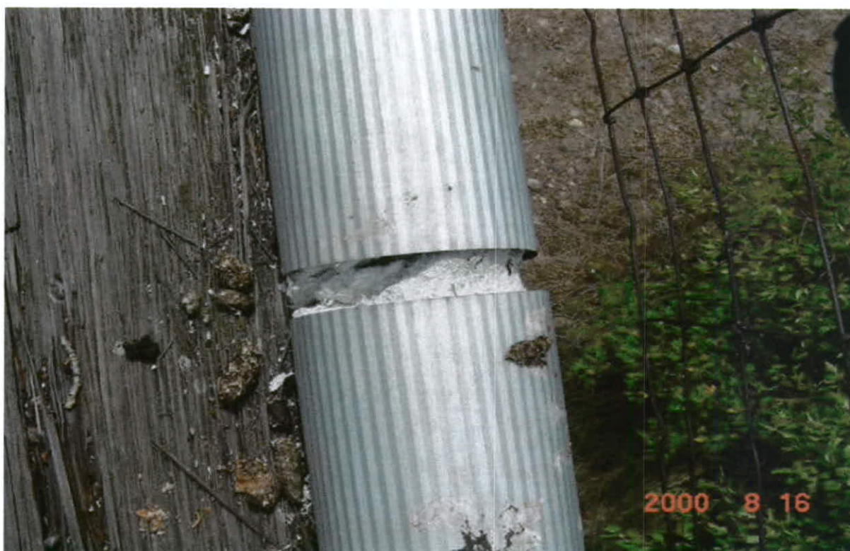
Photo 7 – Close up view of opened seam in metal jacket around asbestos insulation