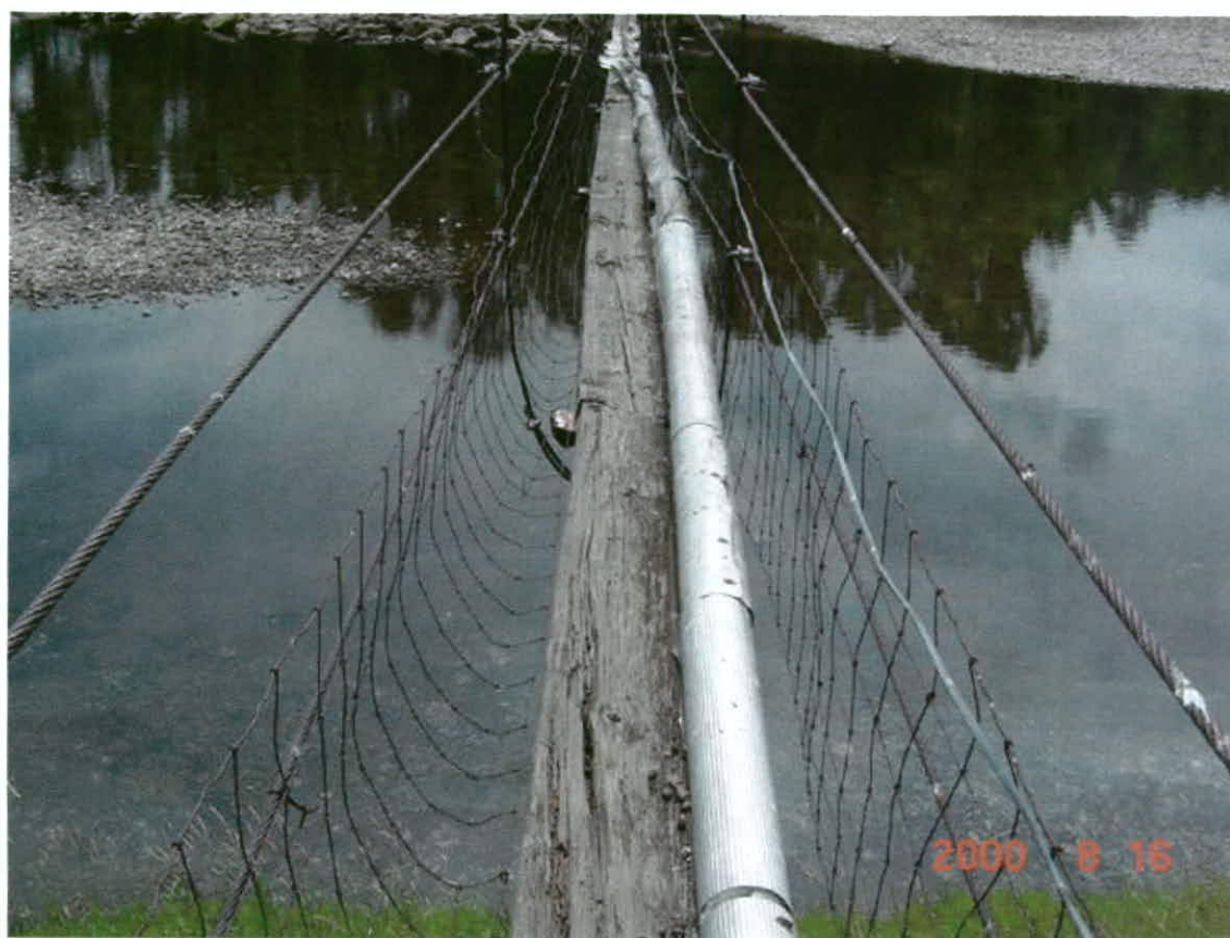
Photo 4 – View looking south across the Tow Creek Bridge in August 2000.