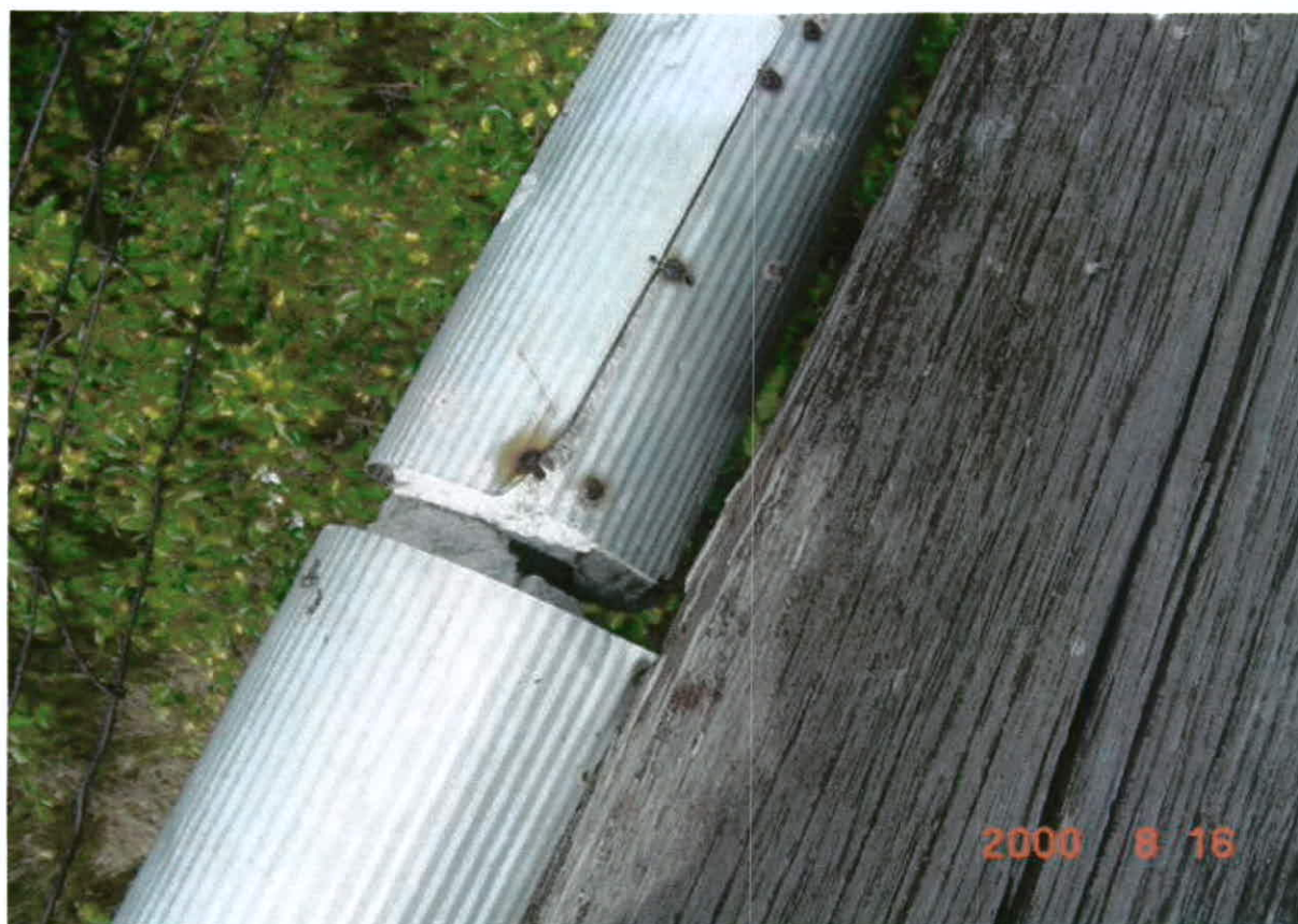
Photo 8 – Close up view of seam in jacket around asbestos insulation.