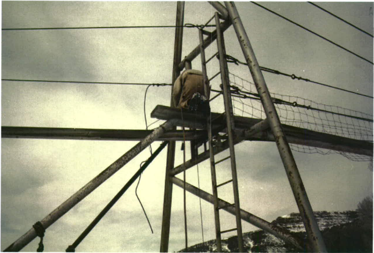
Photo 10 – View of worker cutting pipes and cables connected to south bridge abutment.