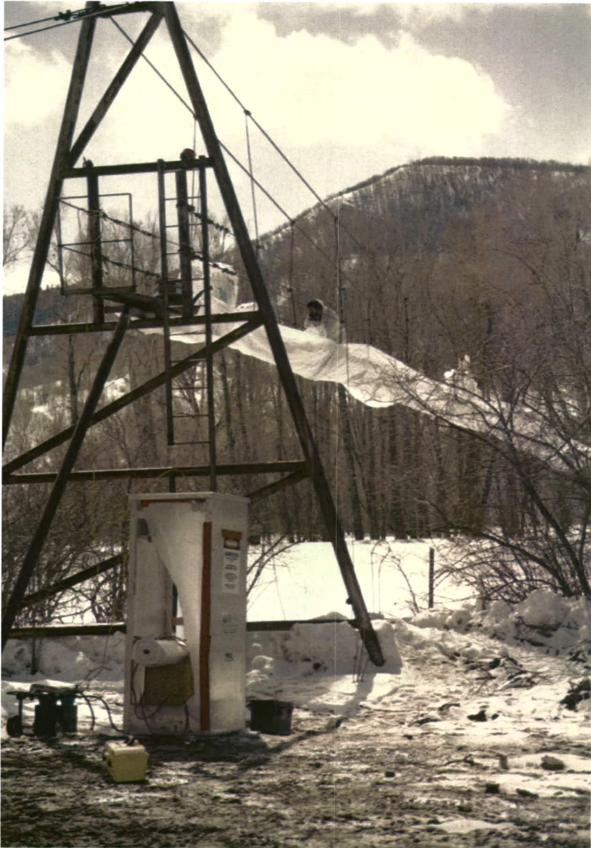
Photo 7 – View of installing plastic drape under north end of Tow Creek Bridge looking south.