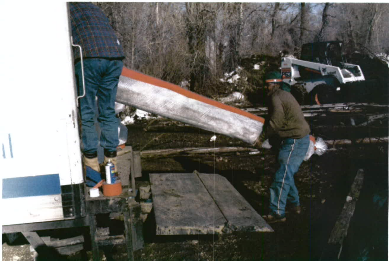
Photo 19 – View of abatement crew loading wrapped timbers and insulation onto service truck