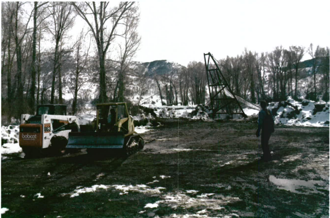
Photo 15 - View of north abutment as dozer and skid steer pull cables to drag bridge across river.