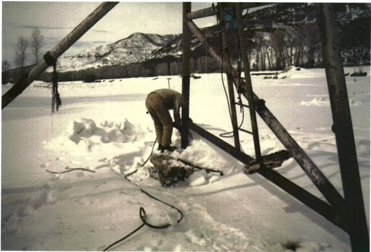
Photo 12 – View of worker cutting notch in supports to south bridge abutment.