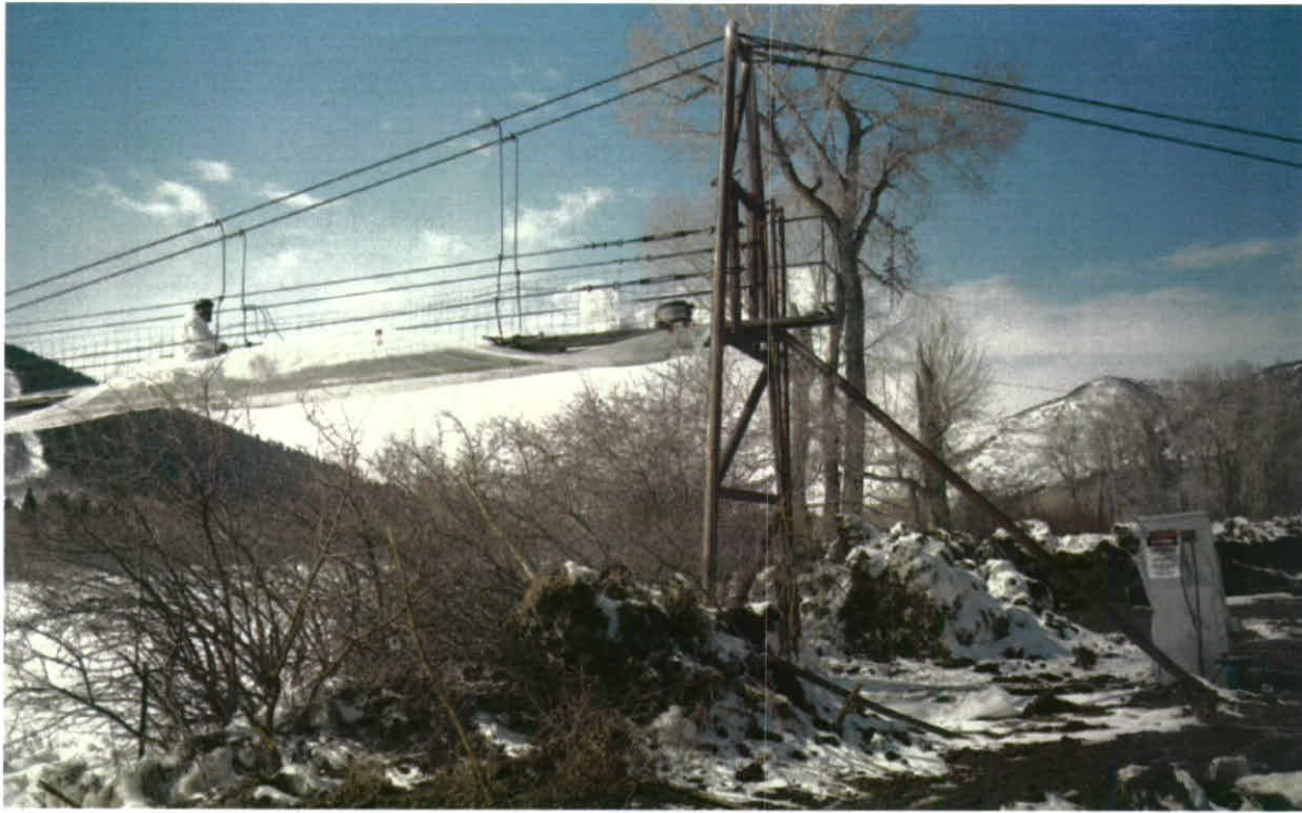
Photo 8 – View looking west at the installation of the plastic drape under the bridge.