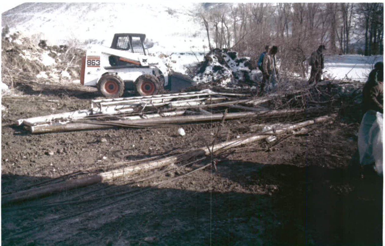
Photo 17 – View of north abutment area with south abutment structure and pipeline on ground.