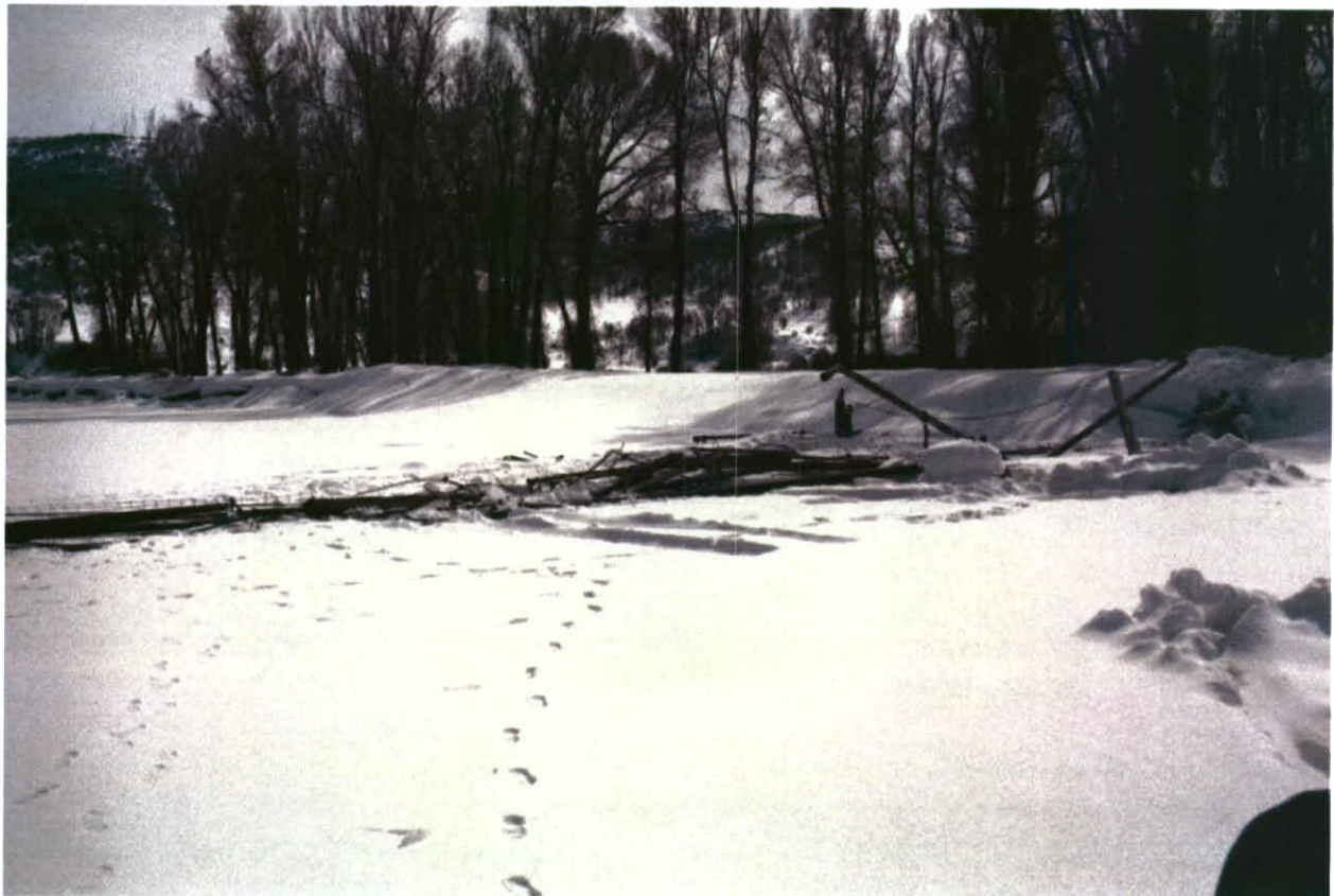
Photo 13 – View of south abutment lying on ice after support cables were cut.