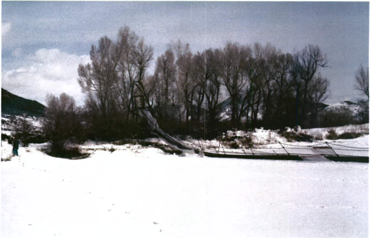
Photo 14 - View of north abutment with bridge lying on ice after south support cables were cut.