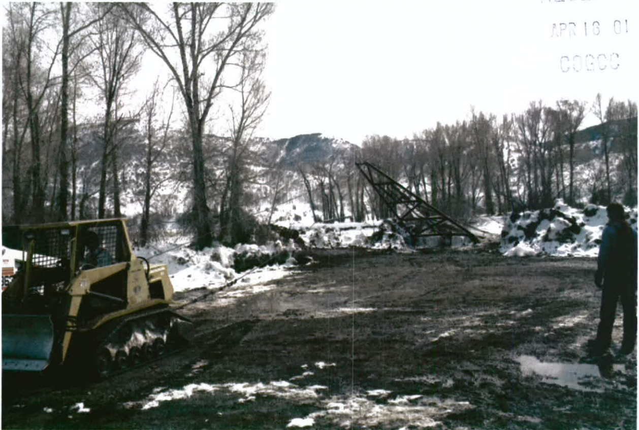
Photo 16 – View of north abutment as it is dragged from its position by the river.