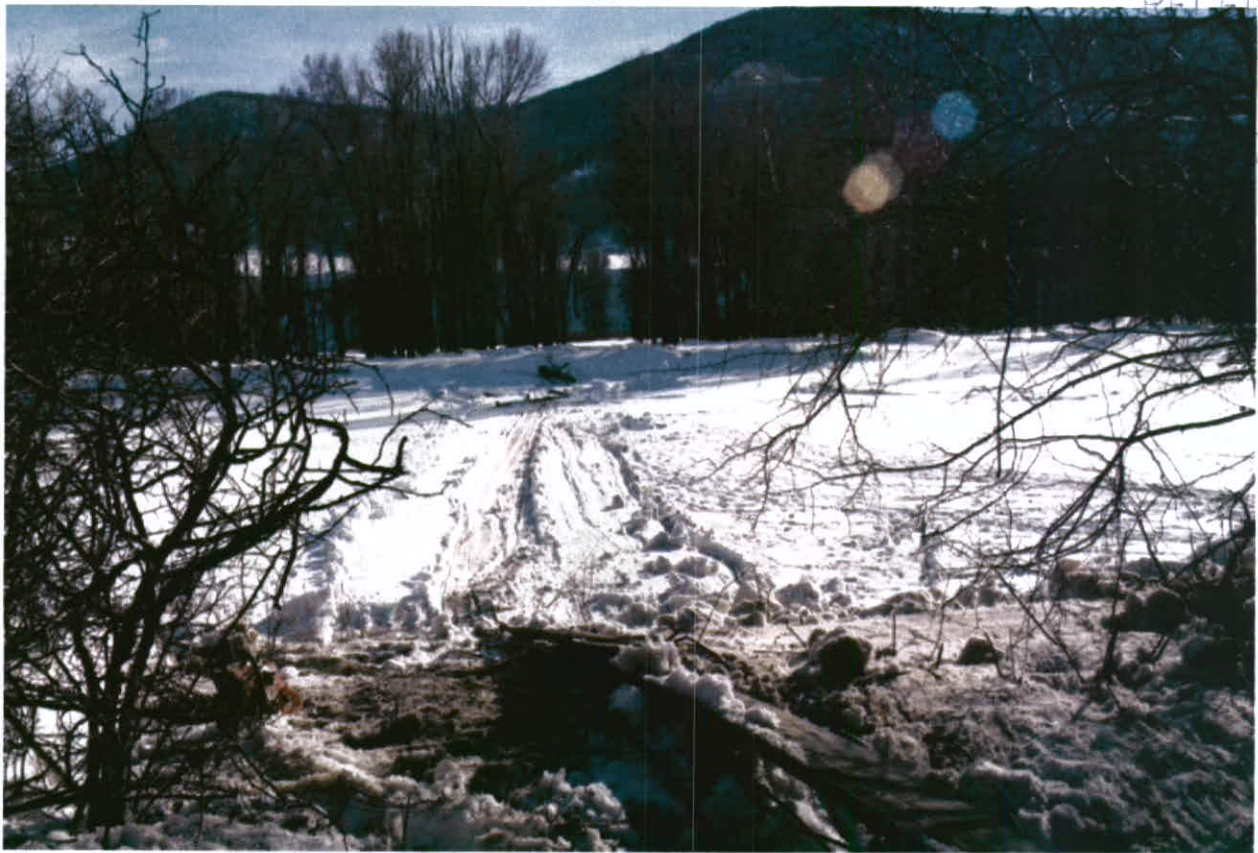
Photo 18 – View looking south across river after bridge was dragged to north side.