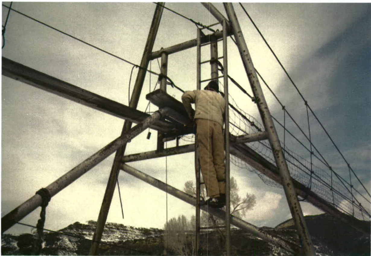
Photo 11 – View of worker cutting pipe under planks at south side of bridge.