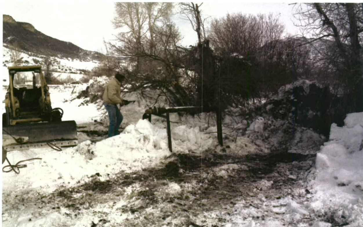
Photo 2 – View looking north at the product load out facility in March 2001.