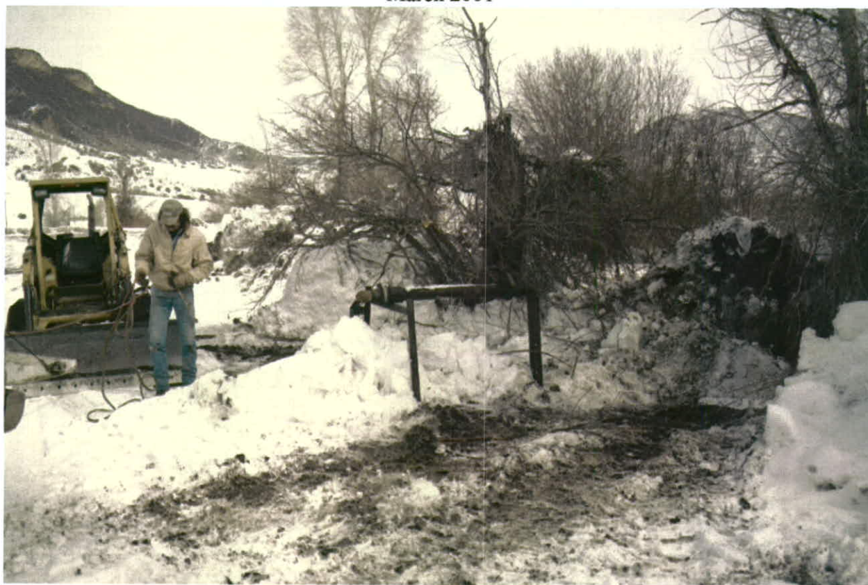
Photo 1 – View looking north at the product load out pipes in March 2001.