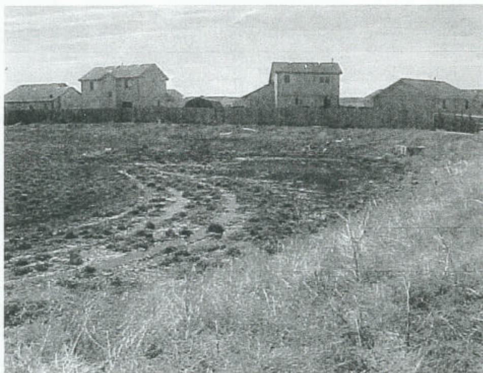
Photo #7: View of man-made retention pond and residential properties south of the site, looking south.