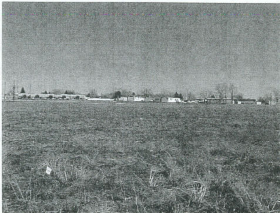
Photo #4: View of site and strip mall and trailer park north of the site, looking north.