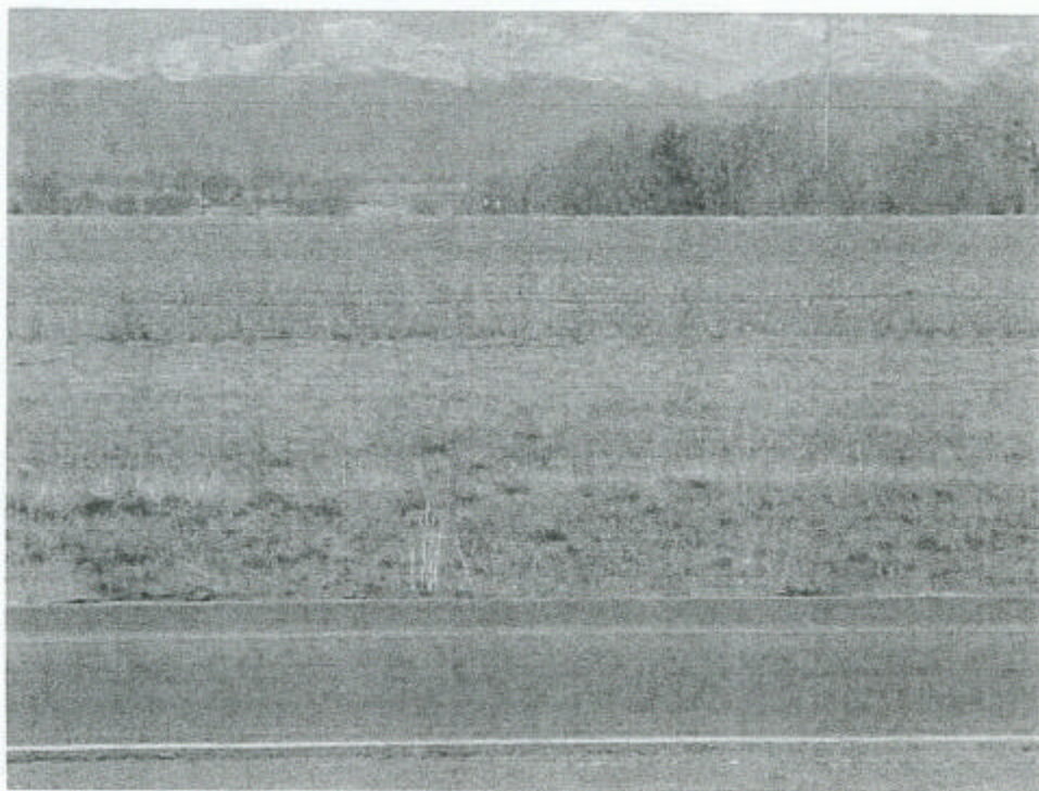
Photo #6: View of 35 th Avenue and agricultural property west of the site, looking west.