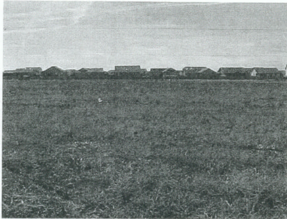
Photo #3: View of site and residential properties to the south, looking south.