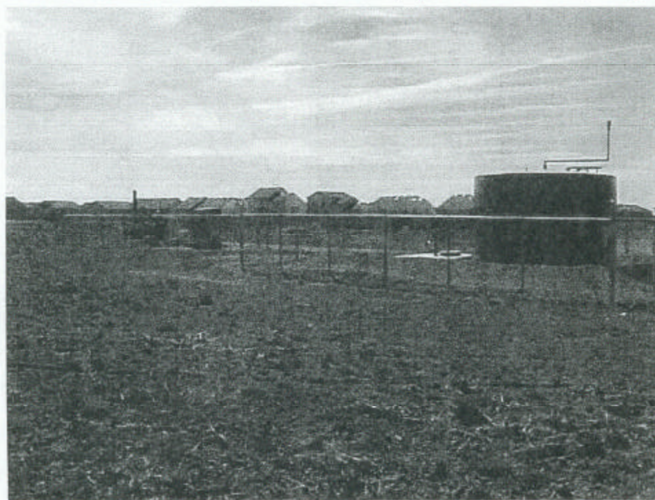
Photo #8: View of the temporary storage tank and pressure vessel on the property to the south of the site, looking southeast.