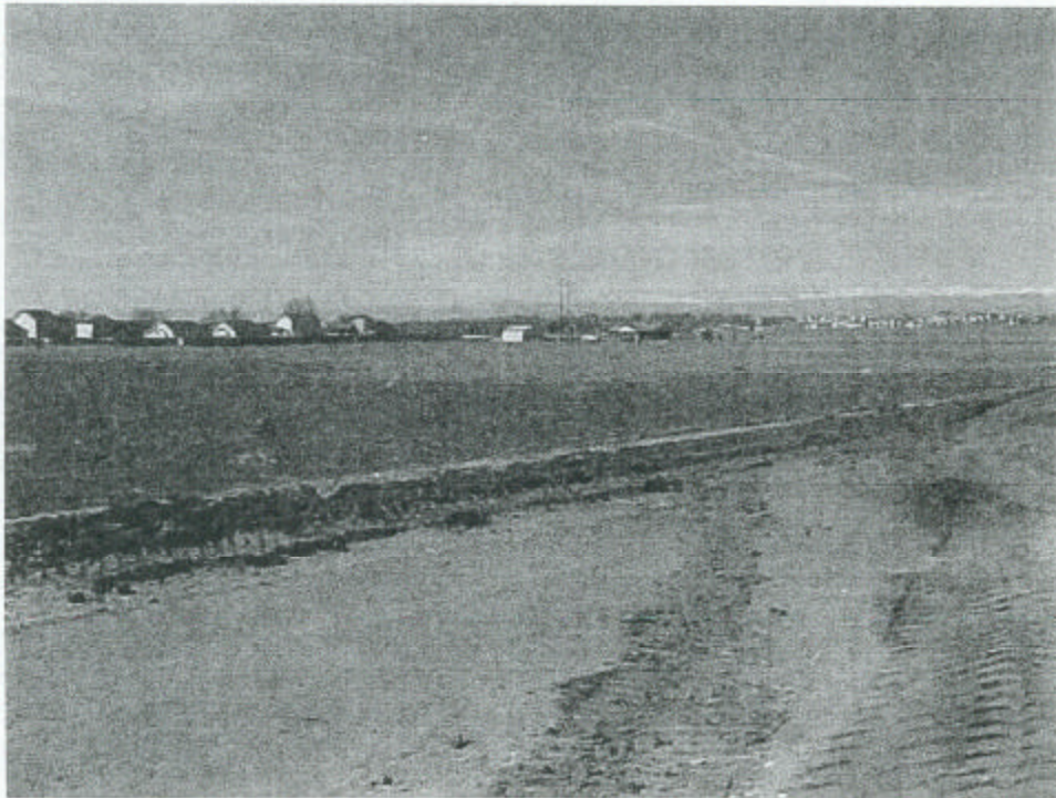
Photo #2: View of site and adjacent property to the east from 37 th Street looking southwest.