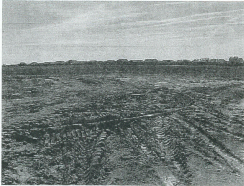
Photo #1: View of the site from 35 th Avenue and 37 th Street, looking southeast.