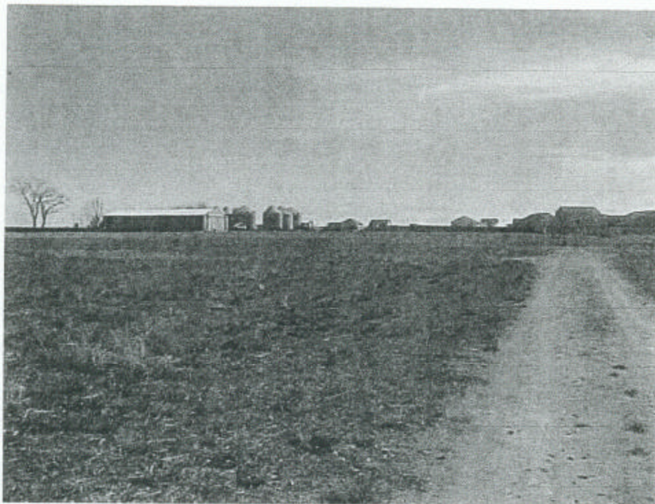
Photo #5: View of the property south of the site and property east of the site, looking east.