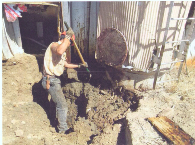
Photo # 23 – Manual excavation of process area after removal of fiberglass tank