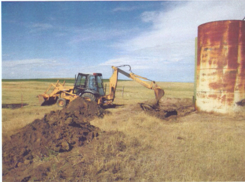
Photo # 9 – Initial excavation of impacted soils from tank berm area